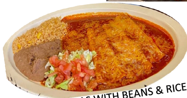
3 ENCHILADAS WITH BEANS & RICE