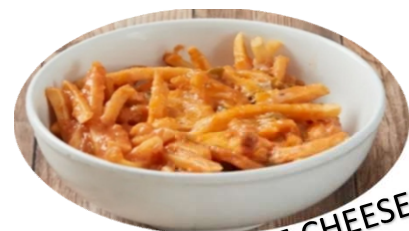
CHILE CHEESE FRIES