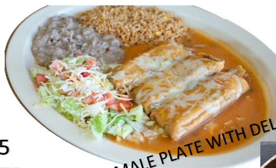
TAMALE PLATE WITH DELUXE