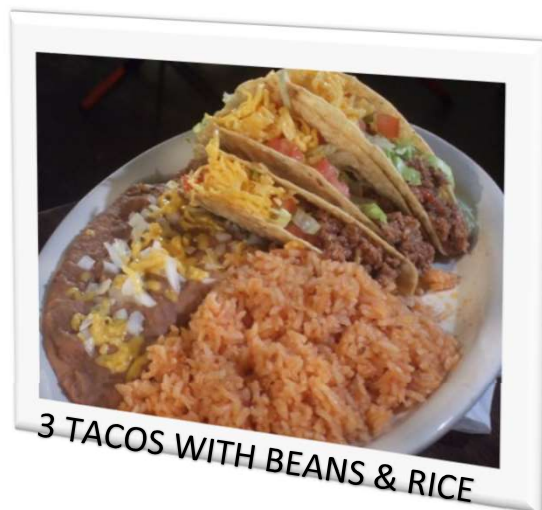
3 TACOS WITH BEANS & RICE